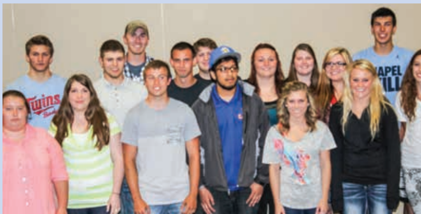
2014 Luck of the Draw scholarship winners.

Join us for our next annual meeting which will be held Wednesday, June 3, 2015. ■